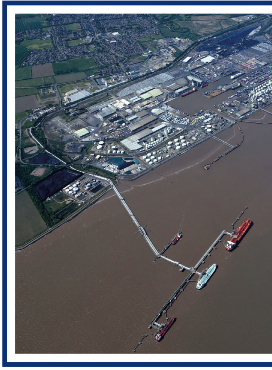
Fig 8.3.20 - Location of Projects, Developments and Activities that are Scoped into the Inter-Project Effects Assessment